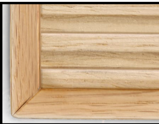
10mm Clashing Example