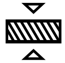
Size 2800 x 1250 x 18mm 2850 x 1220 x 18mm